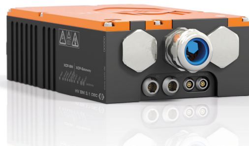
Fig. 1: HV Breakout Module 3.1 OBC for worldwide, one- to three-phase measurement of AC charging.