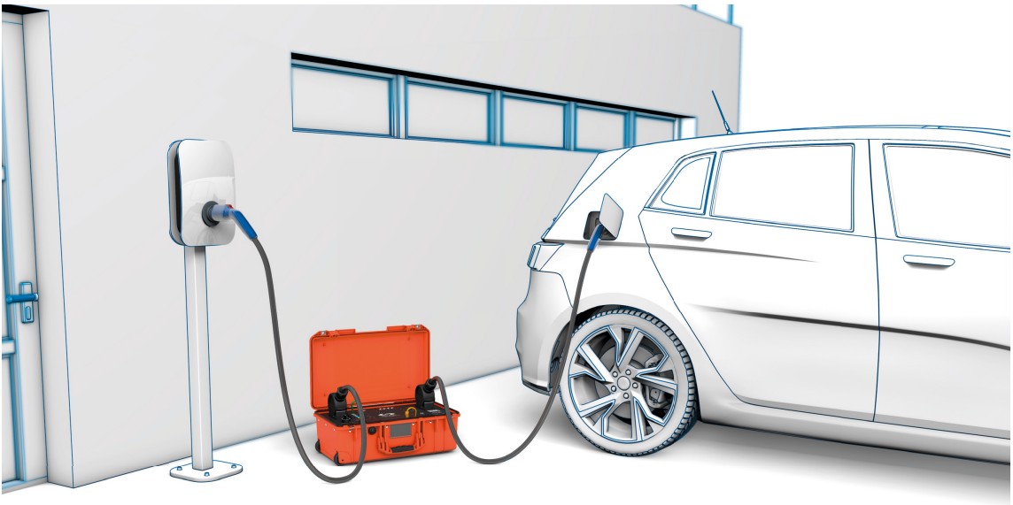
Fig. 3: The customized measurement case is simply connected between the charging station and the vehicle using suitable adapter cables.

compact dimensions of the measuring case meant that it could also be taken along as airline luggage and was immediately ready for use on site. Power was supplied to the measurement case via the low-voltage vehicle battery or via the mains side. The use of an application-specific measurement technology solution with suitable adapter cables eliminated the need for error-prone and time-consuming installation by on-site personnel.