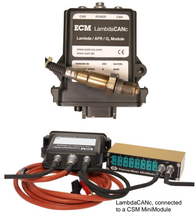
LambdaCANc, connected to a CSM MiniModule

CSM OEM version LambdaCANc meets the complex demands of automotive measurement technology. In addition to providing outstanding measurement range and accuracy, LambdaCANc addresses the two principle sources of error with wideband sensor use: sensor aging and pressure sensitivity .